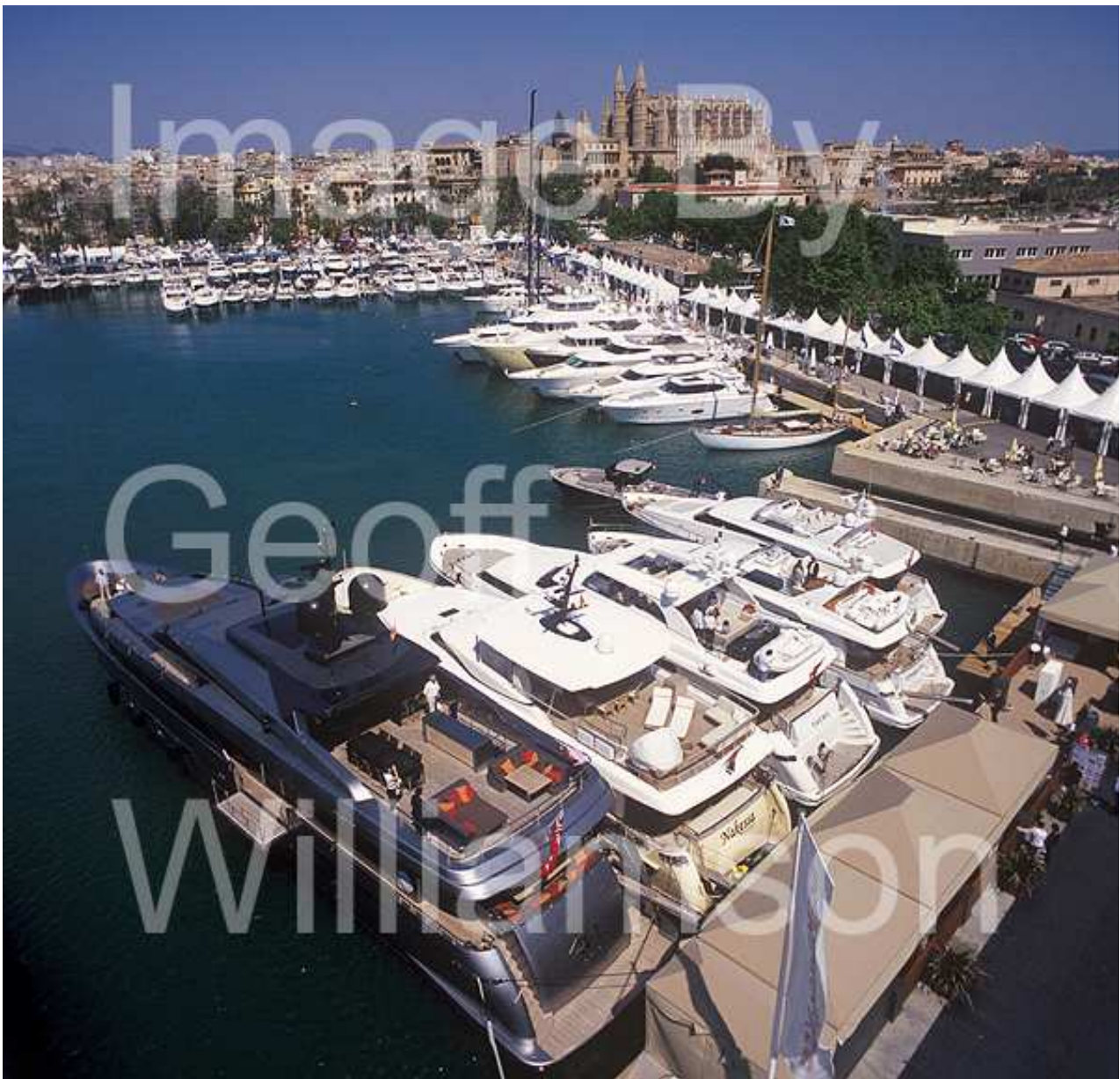
The Sanlorenzo line up at Palma Boat Show 2009 - Sanlorenzo 40 Alloy, SD92, SL88, SL82, SL72 and Bluegame 47 - against the backdrop of historic Palma Cathedral.

Looking for hand crafted Italian perfection for your next superyacht purchase or charter ? Since 1958 the Italian Sanlorenzo shipyard has been dedicated to providing clients with unbeatable quality custom built motor yachts. Sanlorenzo, is ranked 6th shipyard in the world ranking of the Top Builders (Global Build Report 2008). Their yacht building operation is based on two shipyards: the Ameglia Division, for the production of GRP planing motor yachts of between 62 and 108 feet LOA, and the new Viareggio Division (with first launchings in 2007) for the production of navettas in composite materials with semi-displacement hulls of between 92 and 122 feet. The Viareggio division also builds superyachts in aluminium (the 40 alloy model) and in steel-aluminium ( 44 mtrs ).