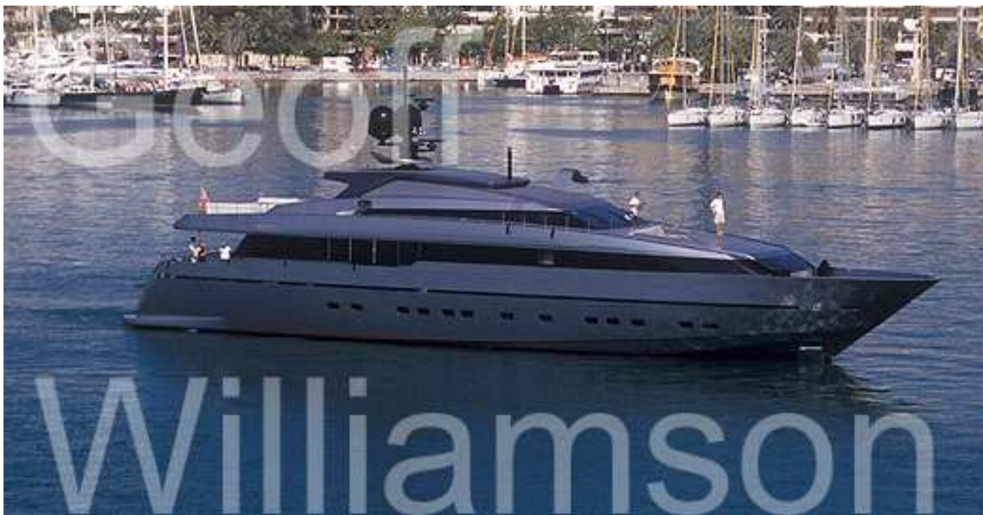
Sanlorenzo 40 Alloy (38.5m) against the background of Paseo Maritimo, Palma.

Sanlorenzo 40 Alloy. The award winning Sanlorenzo 40 Alloy was the recipient of the prestigious “Show Boats International Awards 2008 – Best New Series under 40 Meters”. The 38.5 mtrs long superyacht combines cutting edge technology on the bridge, state of the art communication and entertainment systems with stunning Italian interior design. Spectacular features include the hydraulically operated terraces in the owner’s cabin, gym and main saloon. Nut wood interior are complemented by a palette of vivid colours to produce a truly contemporary and stylish living area. A bespoke LED lighting system is discreetly integrated into walls and furniture throughout, creating an ambiance of brightness and warmth. The 40 Alloy is a yacht of meticulous quality and will meet the highest demands of any owner with its maximum speed of 27 knots.